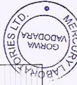
Mercury Laboratories Limited Table III - Statement showing shareholding pattern of the Public shareholder